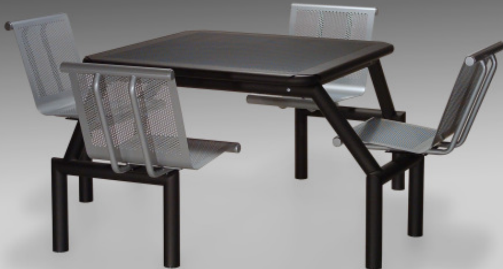
0702 Perf seats with special Perf table top