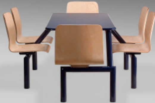
0502 Tom birch seats